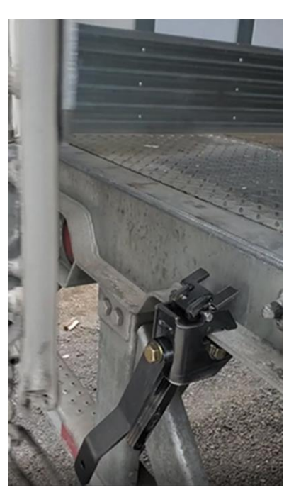
Figure 2c: Moving the Door Stop