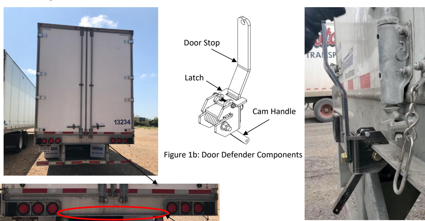
Figure 1a: Door Defender Placement Location