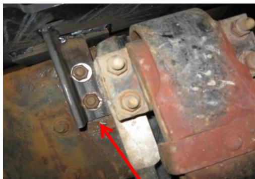
PLACEMENT OF BOTTOM BRACKET