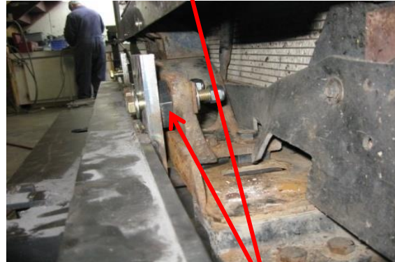
PLACEMENT OF BOTTOM BRACKET