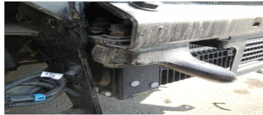
Hook used with large radiator