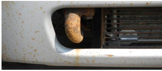
Hook used with standard radiator