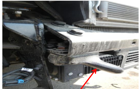
Hook used with large radiator