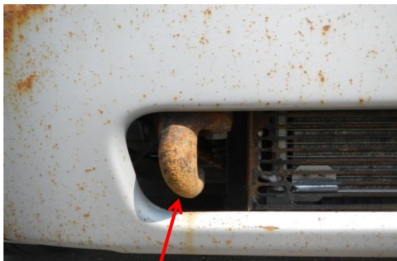
Hook used with standard radiator